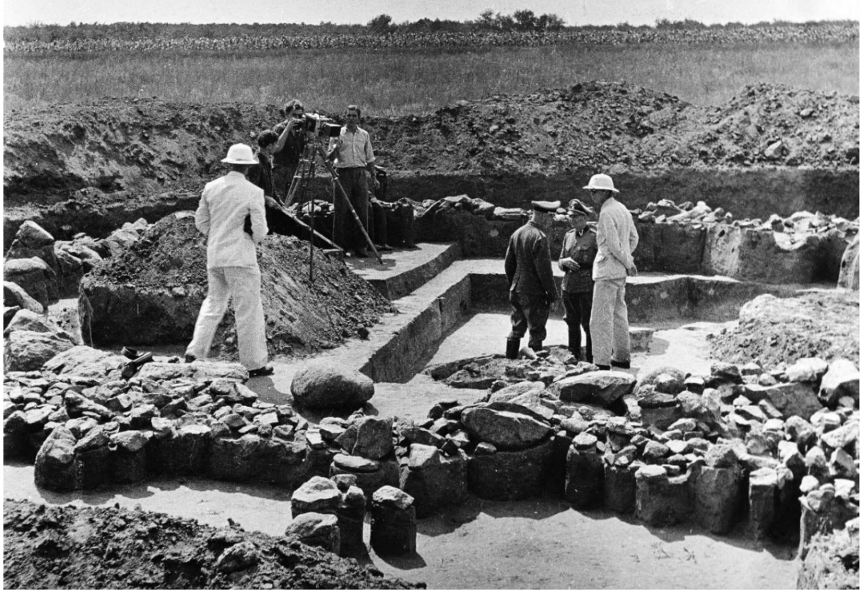
Excavations at Solonje in Ukraine, 1943

conquered and influenced by only one race? What makes this breed so special? This is what the Ahnenerbe was supposed to research and why the SS supported it.