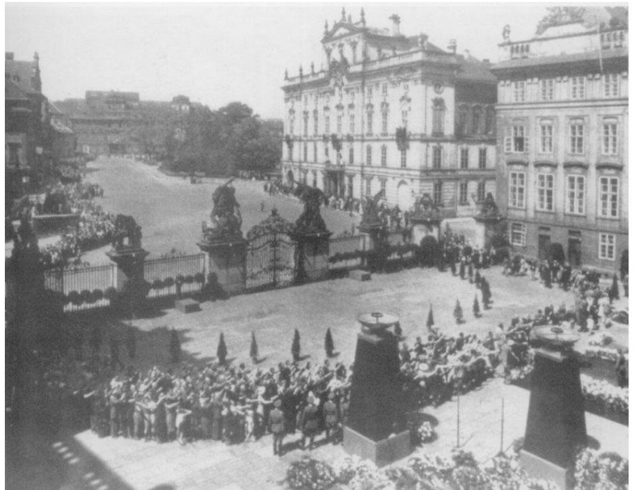
Another very rare photo of the Czechs saying goodbye. Here you can see the long queues of people very well.

Lina: If I understand your question correctly, did my husband think like Himmler in relation to religion? I will say that my husband was a Christian and an SS man and I will try to explain that. The SS was a unit based on love for the people, reverence for the past and honoring our origins. A subject that Reichsfuhrer SS Himmler spent hours pondering was the question of where we came from. How is it that almost the whole world