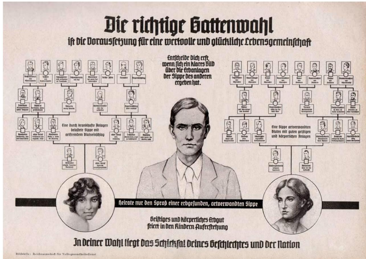
The right choice of spouse