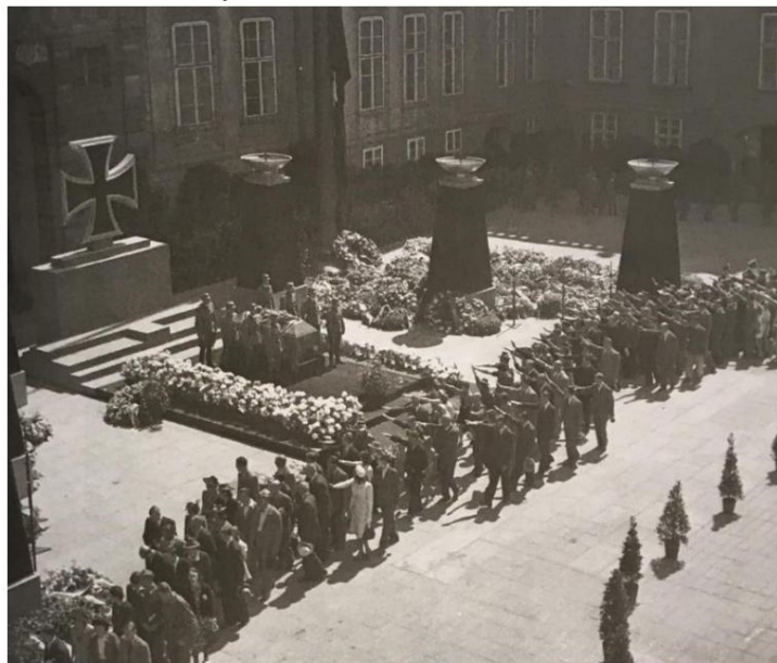
June 7, 1942 in the courtyard of Prague Castle. The coffin on display containing the remains of Reinhard Heydrich.

He set to work to change that, decreeing better rations, working conditions, paid vacation and travel, less control and greater access to him. He wanted the people to help Germany win and assured them that their voices would be heard. It worked, production