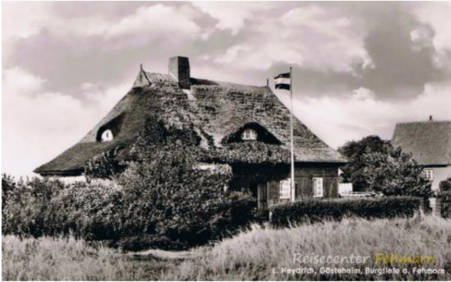
Heydrich's beach house on Fehmarn

Lina: Yes, the SS always takes care of theirs as best we can. My husband had very loyal friends and comrades. He was very popular because of his friendliness and direct manner. I understand that he was sometimes difficult to work for, but he was always respected. I would support any former SS man who needs it. My husband had an inn on the North Sea and I hosted many friends there. I believe it was burned down because of its political character.