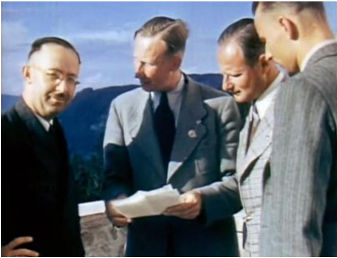
Heinrich Himmler, Reinhard Heydrich and Karl Wolff at the Berghof. Silent color film shot by Eva Braun, May 1939.

Did your husband ever disagree with Himmler?