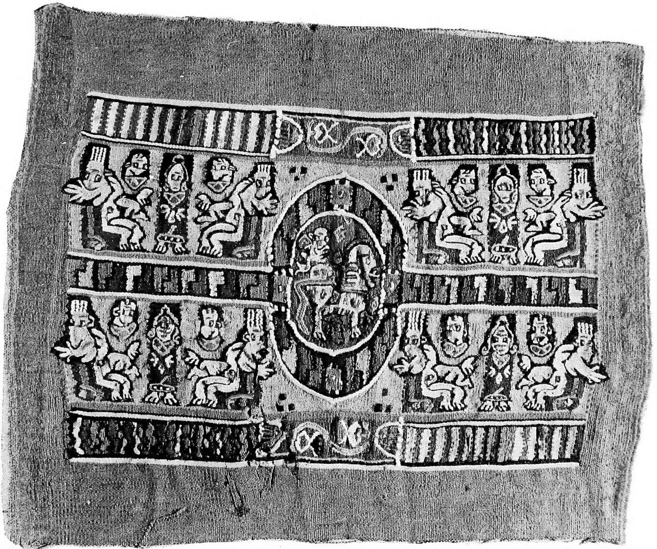
Fig. 1 Panel, 34 × 27 cm. A horseman in the center with several pictures of a sitting woman with a child on her knee. Textile Museum 1969.1.1