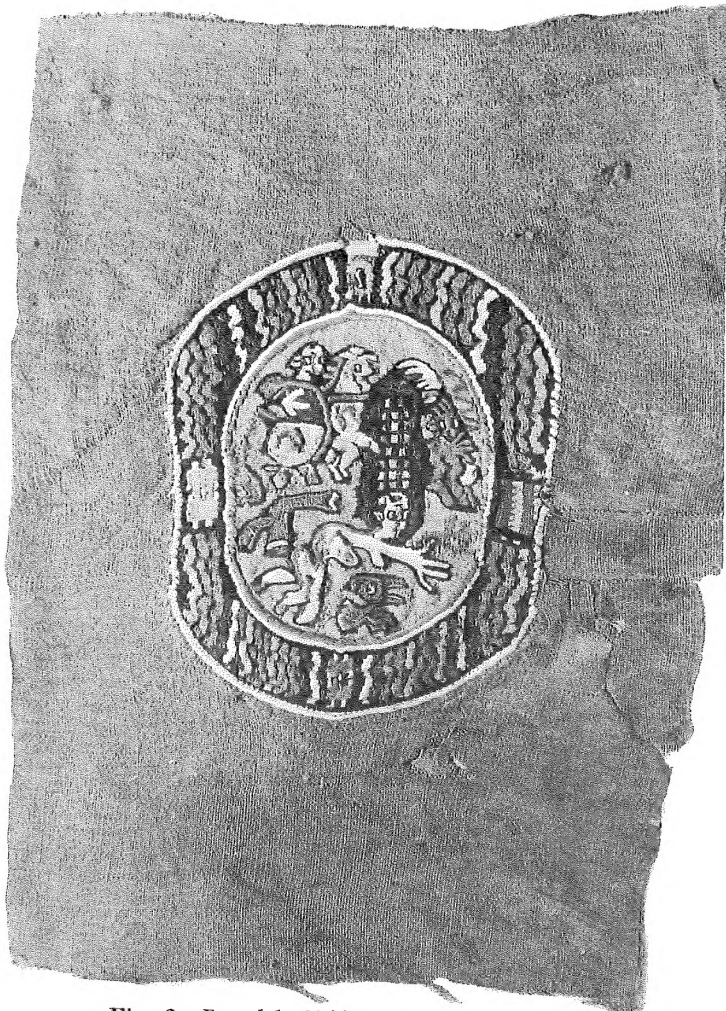
Fig. 2 Roundel, 33 × 22 cm. Horseman, with a naked girl in front of a swimming pool. Textile Museum 1969.1.2